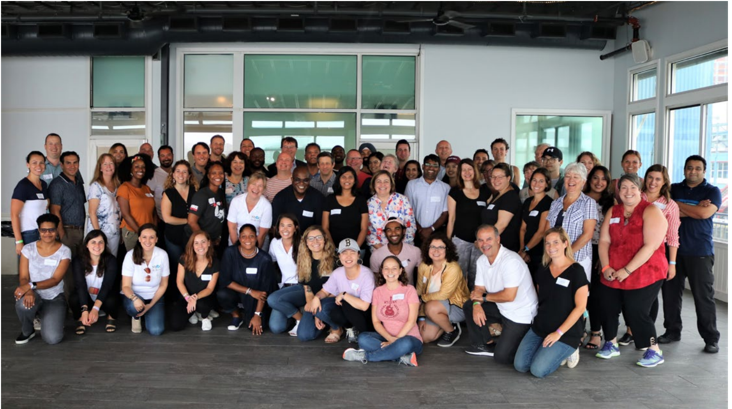
The NYeC team at our annual off-site gathering this year at Chelsea Piers in NYC.